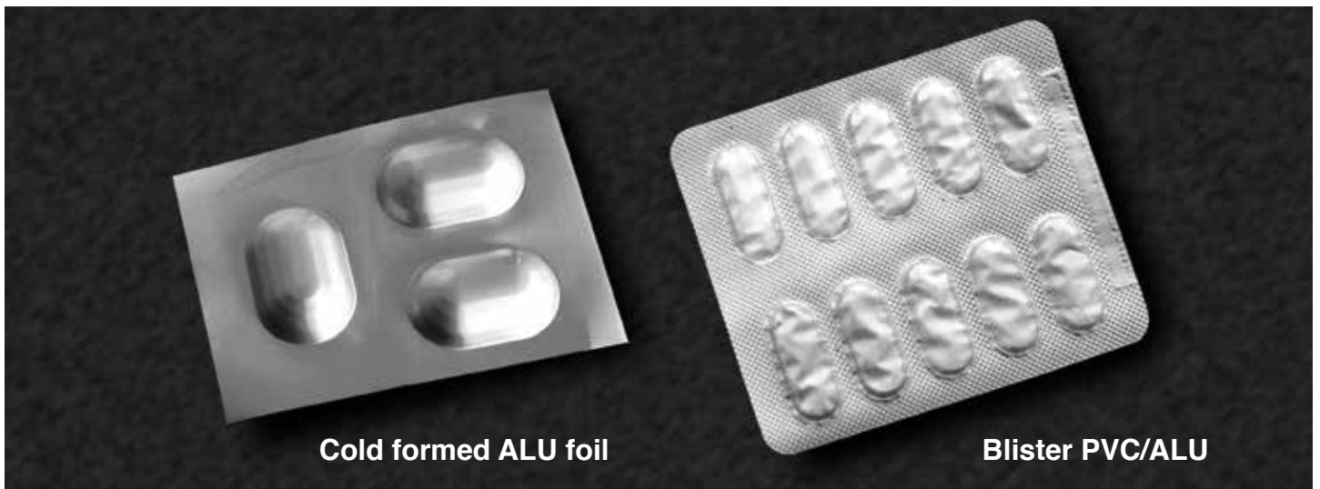
Cold formed ALU foil

IN-PACK is the pneumatic blistering machine, ideal for clinical trials, stability testing, pack development and low volume production for laboratory or chemist's shop. The machine is thermoforming, sealing, coding and cutting blisters in PVC/ALU and ALU/ALU.